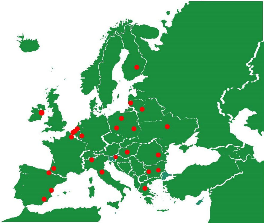
ESER 2018: 32 regions and cities