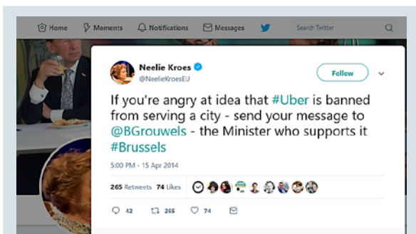
When Neelie Kroes was still Competition Commissioner she was very supportive of Uber, including through very active tweeting, as in 2014 when she urged to protest against a decision to ban Uber temporarily in Brussels.

As Digital Agenda Commissioner, Kroes was a staunch defender of the company, writing in April 2014 that she was “outraged” by the decision of a Brussels court to ban Uber, adding that she had “met the founders and investors in Uber”, and that “Uber is 100% welcome in Brussels and everywhere else”. 22 She even started a #UberIsWelcome hashtag on Twitter. 23 Its not hard to see why Uber would want to recruit her in the hope that, as TechCrunch reported, Kroes’ presence and advice could help “steer away the threat of